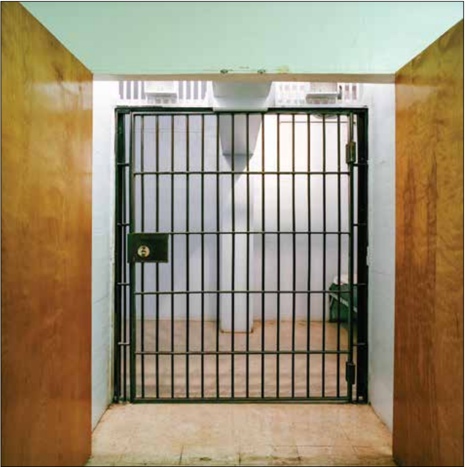
Final Holding Cell, The Omega Suites

“Simply put, there is no 'humane' way to extinguish a human life...The middle-of-the-night bedside visits of those I'd executed were relentless. Visions of these dead men sitting on the edge of my bed wouldn't fade—even with heavy doses of alcohol.”