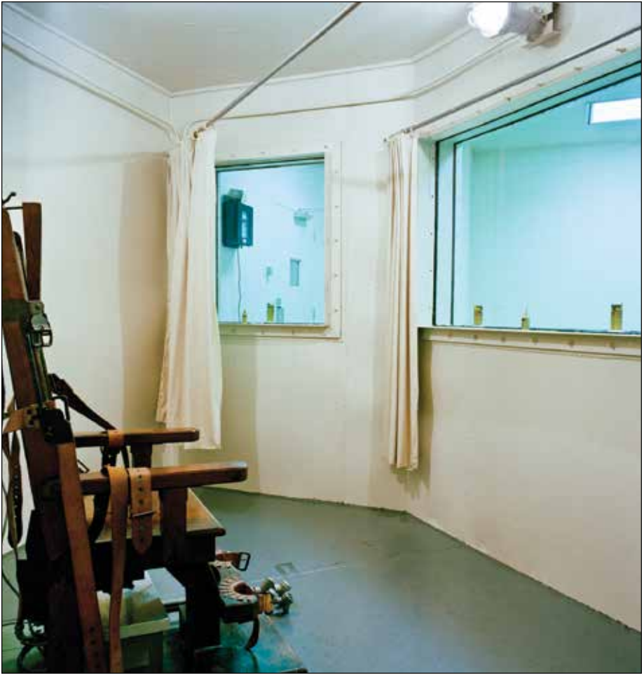
Gas Chamber, The Omega Suites

“Victim's perspectives, taken holistically, make a compelling case against the death penalty. When it comes to the death penalty, almost everyone loses.”