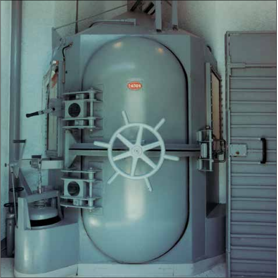
Gas Chamber, The Omega Suites

“The majority of the world's countries are now abolitionist for all crimes. Most of those that retain the death penalty do not actually use it, and the minority of states that still execute people frequently do so in violation of prohibitions and restrictions set out under international law.”