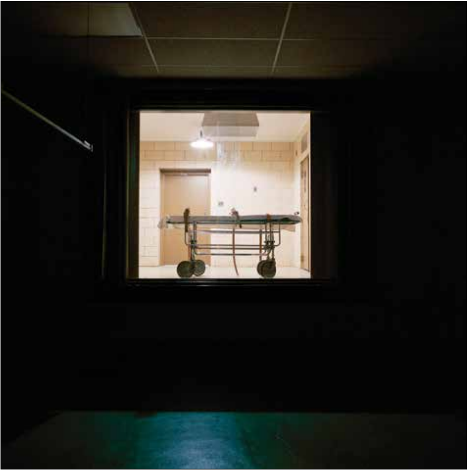
View from Witness Room, The Omega Suites © Lucinda Devlin

“I wish that this publication will help States and other stakeholders to move forward the discussion of ending permanently the use of the death penalty.”