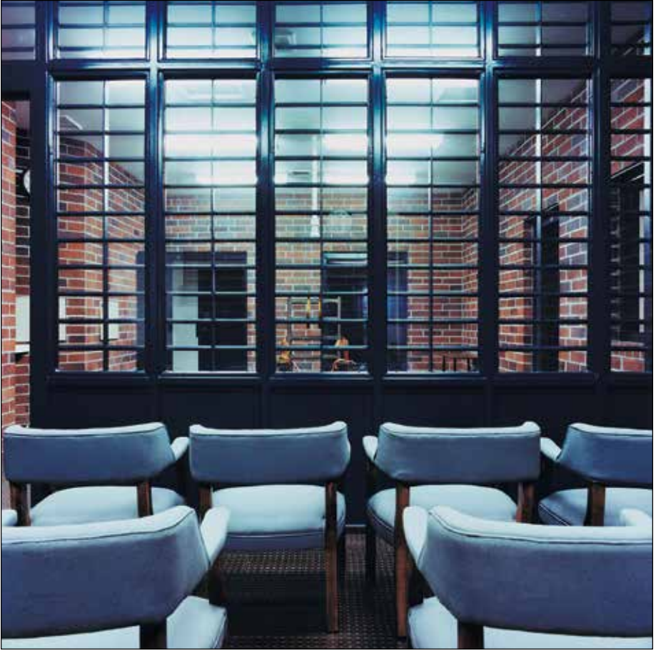
View from the Witness Room, The Omega Suites © Lucinda Devlin

“When one realizes the diversity of victims and the great pain each victim suffers, one would doubt that the death penalty serves victims.”