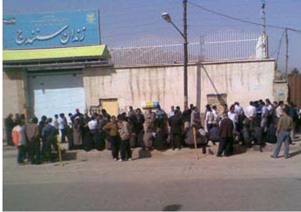
Sanandaj Prison.