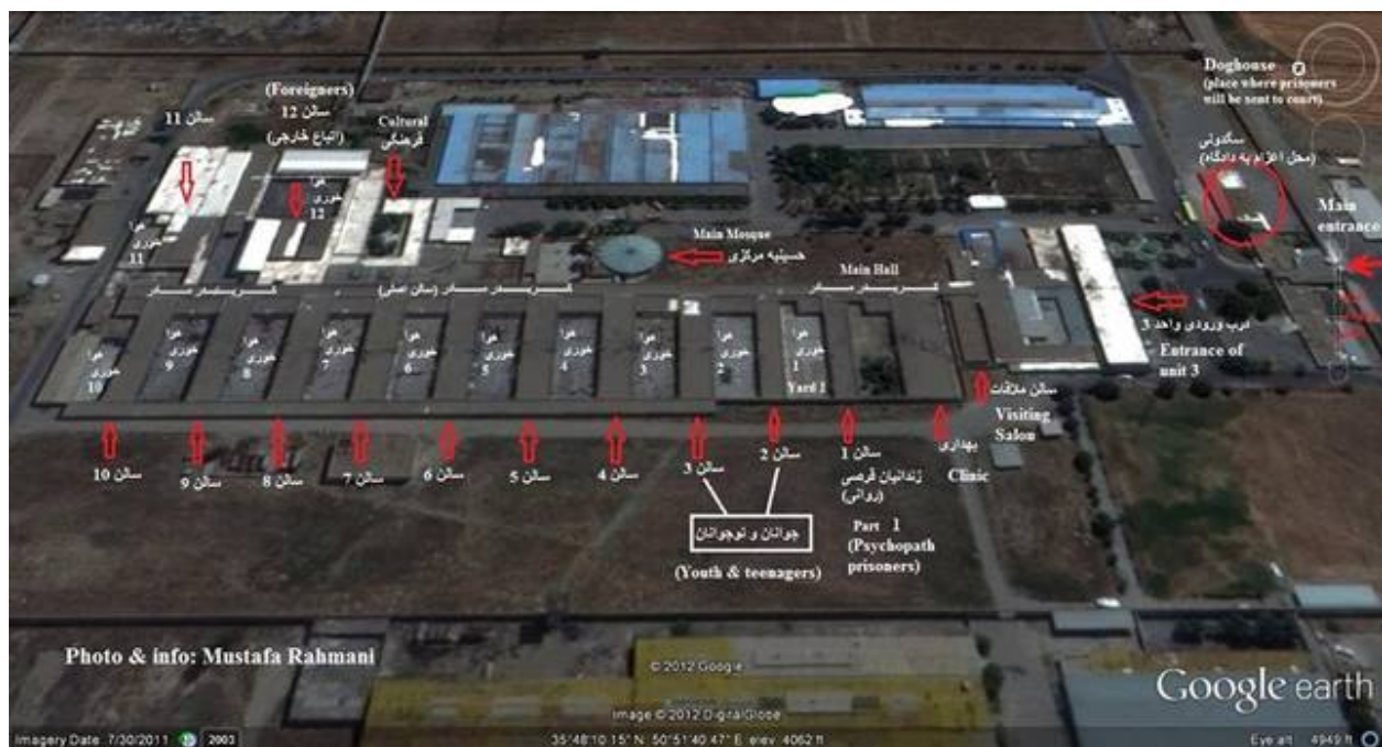
[Map of Qezel Hesar Prison 162 ]